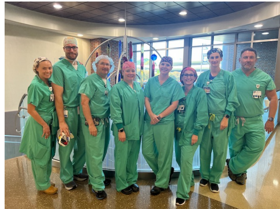
Members of Saint Luke's Heart Transplant Team the day of the program's 1,000th heart transplant. Thank you to all members of the Saint Luke's team who are involved in every aspect of care for our heart transplant patients throughout their transplant journey.

This communication (including content it links to) is intended only for the use of the individual to whom it is addressed and contains information that is non-public, proprietary, and confidential. You should not transmit or further disseminate this communication to any unauthorized persons, including but not limited to parties external to Saint Luke's Health System.