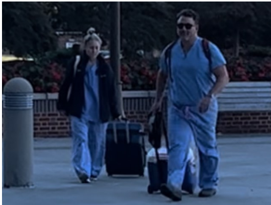
Precious cargo arrives at Saint Luke's Mid America Heart Institute early in the morning of Oct. 5: the donor heart ahead of the 1,000th heart transplant. Saint Luke's is deeply grateful to each donor and their loved ones for this gift of a second chance at life.

Years from now, when we've reached a second thousand lives saved, we can only imagine how different health care might be, or how far science and technology will have taken us. But we can be sure that at the heart of it all will still be those who serve tirelessly, who give selflessly, and who make miraculous second chances happen. And we will continue to be sincerely grateful for them and all they do.